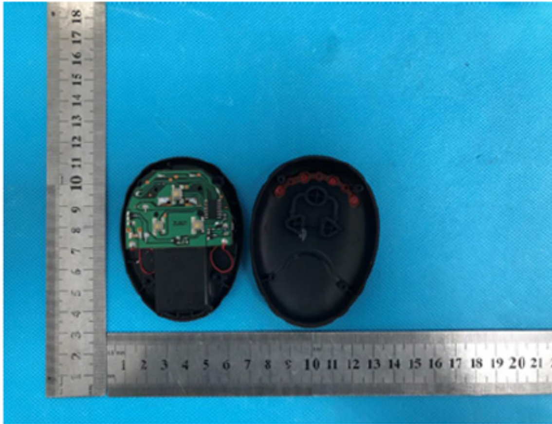
Open view of EUT